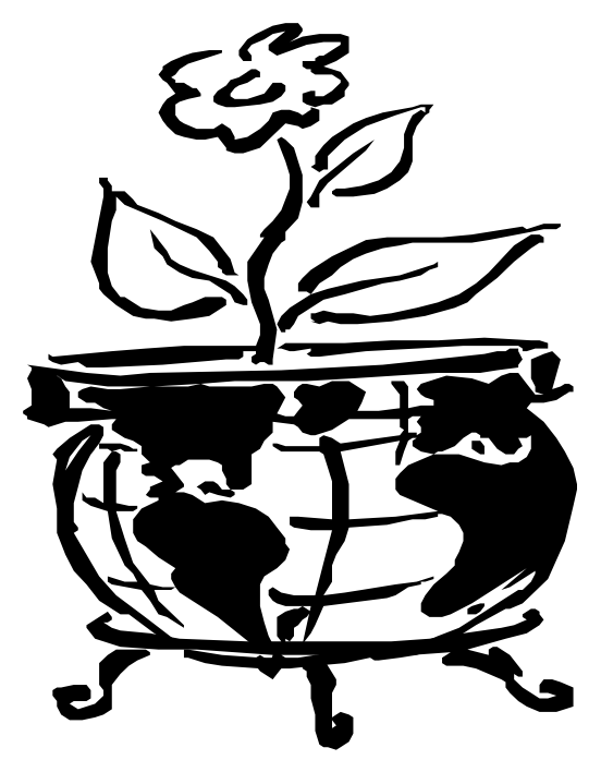
3714 Windmill Road