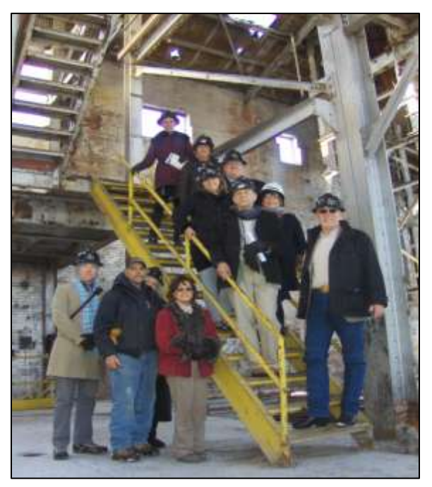
Power Plant at 800 W. 17th Street in downtown Cheyenne

If the project concept has been determined, we evaluate it in the context of other factors. For example, if the community wishes to adapt a particular building for use as an arts facility,