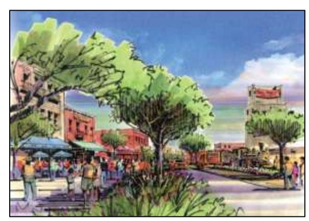
Artist's rendering of public spaces in the West Edge Project area

The West Edge Project is a City-driven development initiative on the west side of downtown Cheyenne. The project aims to mitigate storm water, manage brownfields, and create civic amenities as part of a larger effort to revitalize the flood-prone Capital Basin on the City's west side. Still in the planning and information-gathering phase, it is intended ultimately to create a mixed-use neighborhood.