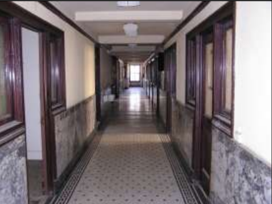
The Hynds Building was built to last, and its interior (right) shows that it has been well-maintained.