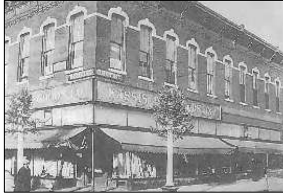
The Carey Building today (left) and as it originally looked (right). Many a beautiful old façade can be found hiding under mid-century "improvements."

vacant now, it was consistently used for many years for retail, office, and residential space. If the metal cladding were removed to reveal the original exterior, the building could be listed as a contributing structure to the Downtown Historic District. It would also be a much more attractive property for a mixture of uses similar to those it housed in the late 19th century. It is about the same size as the Hynds Building, which is to say that it ought to remain a candidate if an Artspace project moves forward in Cheyenne.