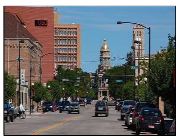
Downtown Cheyenne, looking towards the State Capitol

Downtown Cheyenne's recent history mirrors that of like-size cities across the U.S. Big-box retail stores in the suburbs lured customers away from the urban core, leaving downtown streets with little commercial activity. Cheyenne has worked hard, however, to repopulate its