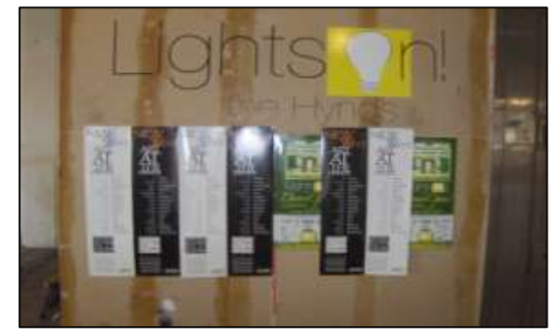
LightsOn! promotional board on the first floor of the Hynds Building

through the Cheyenne Police Department's new downtown patrol program. Civic leaders tell us that "almost all of the issues have been mitigated" as a result of this new program – a positive sign for the future of downtown Cheyenne and those who believe that downtown can be the cultural and social centerpiece of the Cheyenne region.