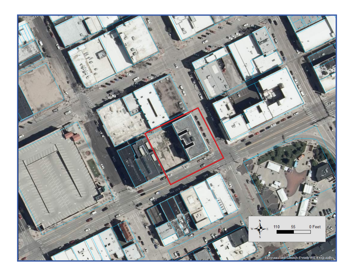
Figure 1: The Hynds and the Hole Study Area